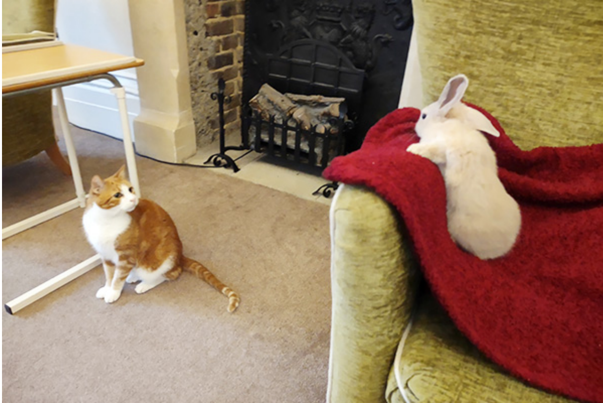
Look who's in my bed!