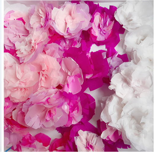
These colourful creations will look stunning!